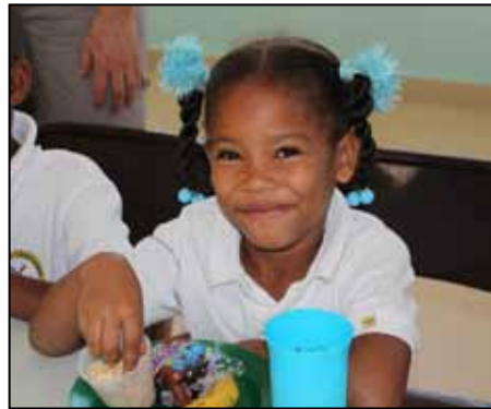
A student enjoys her breakfast. Project 52 raised the funds to purchase $26,000 of kitchen equipment for the school's feeding program.