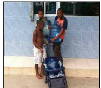
(left to right) Children gather at the school's kitchen for breakfast. Boys from the neighborhood deliver clean water to a family.